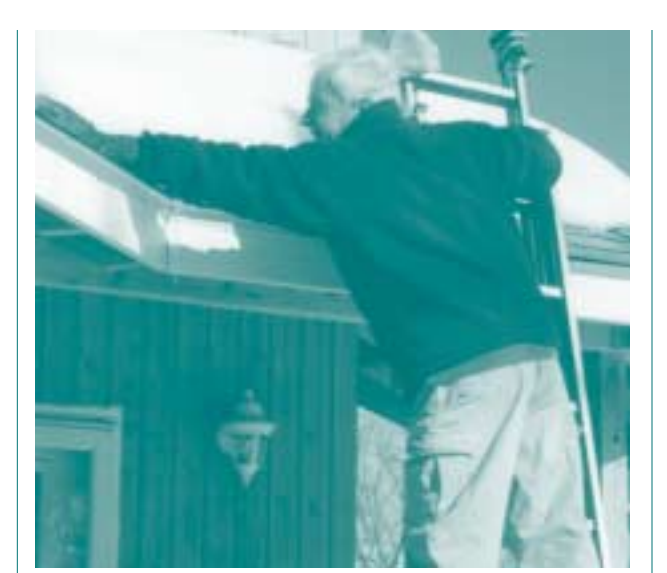
Activities we have always been able to do safely might become risky as we age.

residents was effective in reducing one of the most serious outcomes of falling - hip fractures.